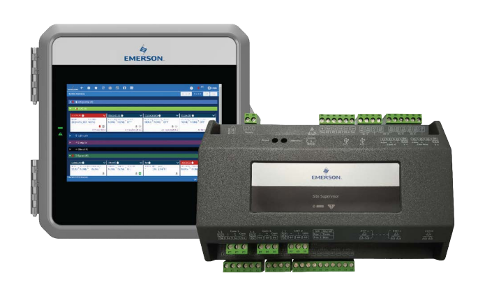
E3 and Site Supervisor Controllers

Reset or power cycle an upgraded E3 approximately 10 minutes after the upgrade is complete.