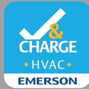
HVAC Check & Charge