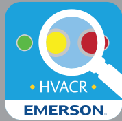
HVACR Fault Finder